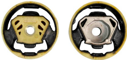
Use PFF85-830 & PFF85-831 For OEM part number 5Q0198 037 A