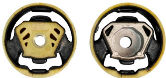
Use PFF85-830 & PFF85-831 For OEM part number 5Q0198 037 A